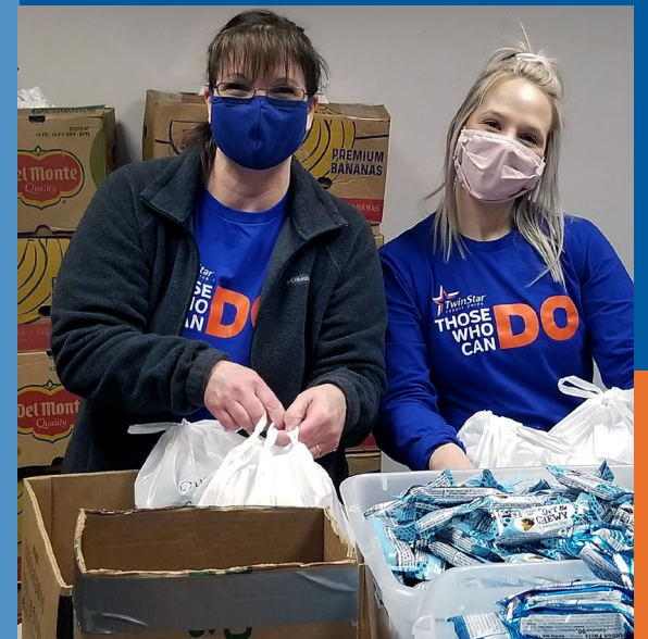
Team TwinStar at All Kids Win for a bagging party.