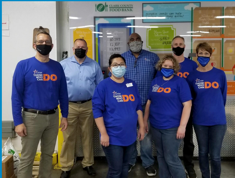
TwinStar employees volunteering their time at Clark Co Food Bank.

This report highlights TwinStar's community impact in 2021. Thank you for supporting our efforts to make a difference in our communities.