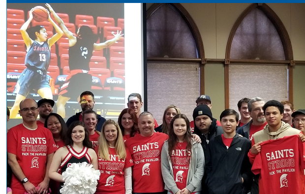
TwinStar night at SMU.

We helped support various Saint Martin's scholarship fundraisers, athletic programs and its Diversity, Equity, and Inclusion lecture series on campus.