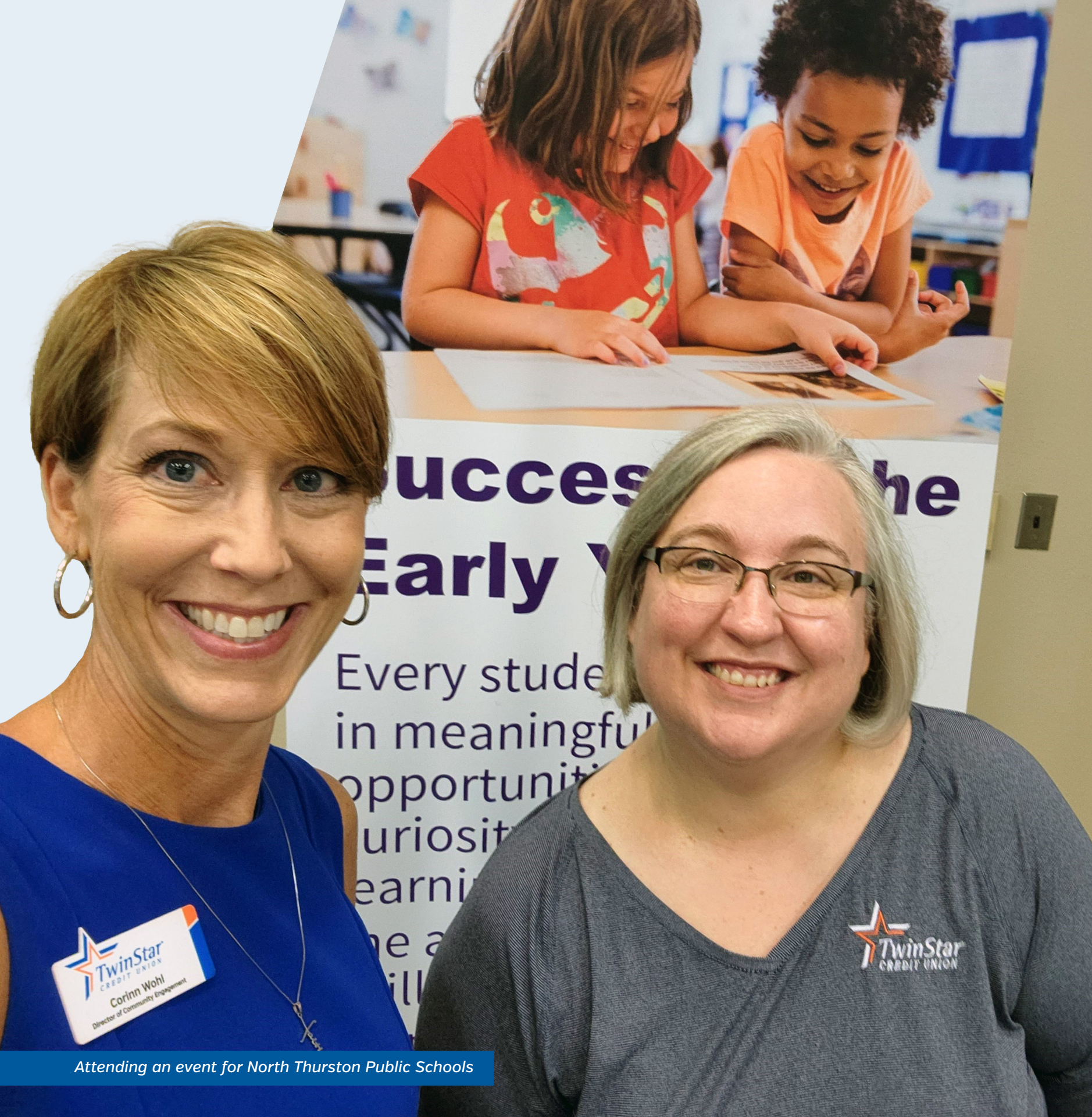
Attending an event for North Thurston Public Schools