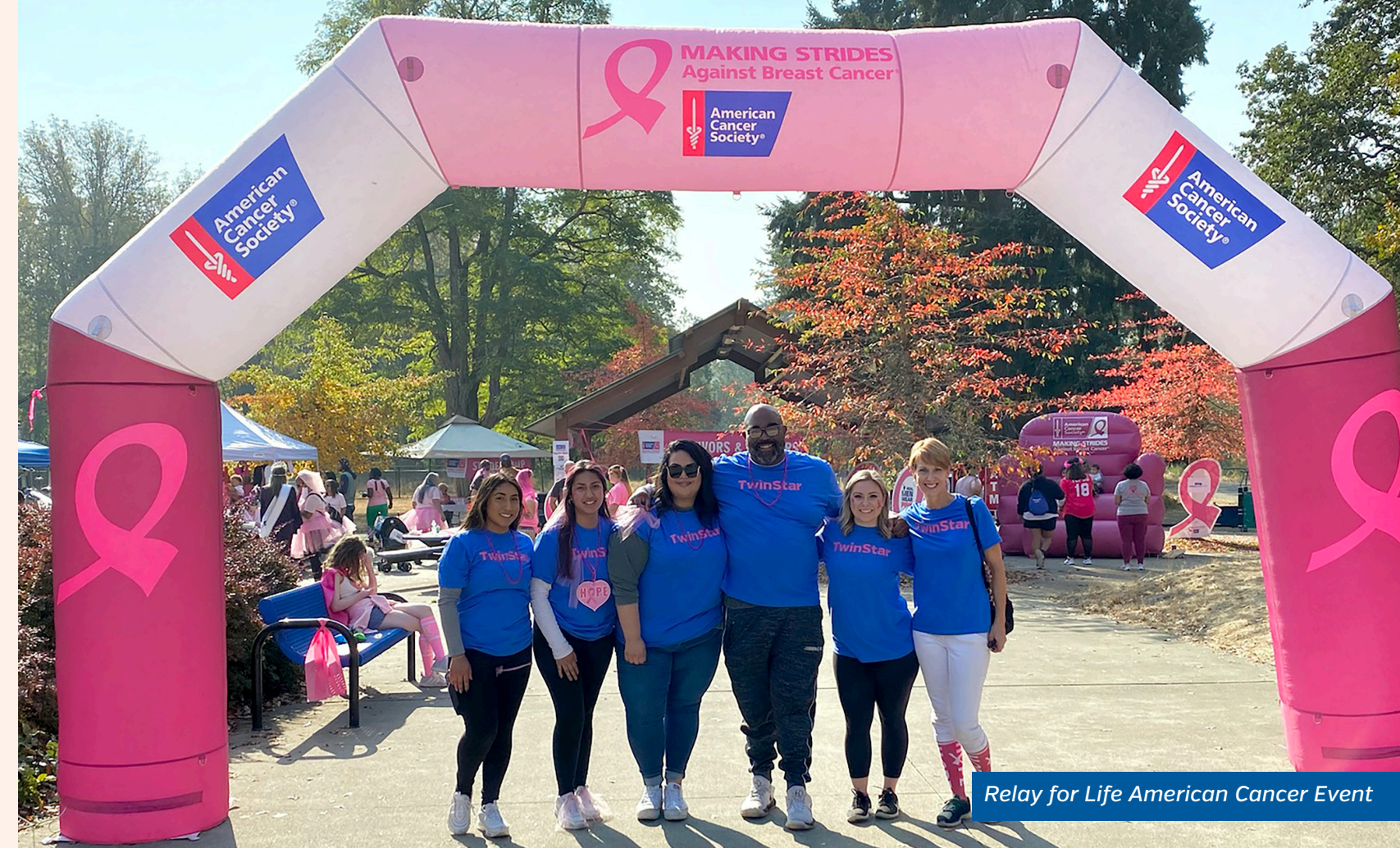
Relay for Life American Cancer Event

TwinStar provides volunteers and financial support to All Kids Win, helping hungry and at-risk students with weekend food and support so they can focus on their education.