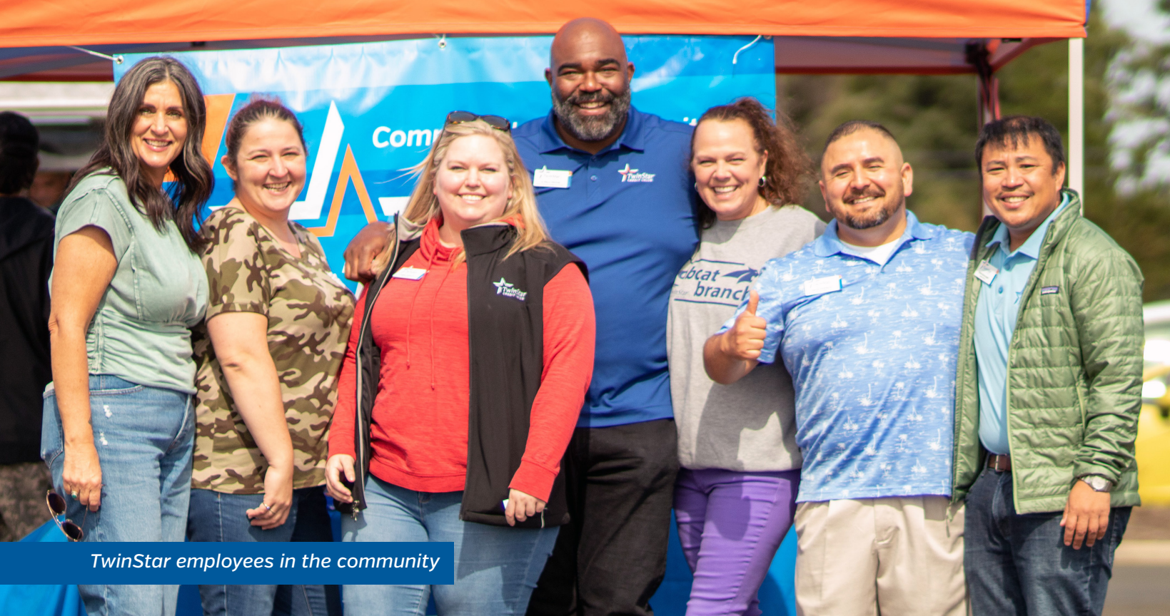
TwinStar employees in the community