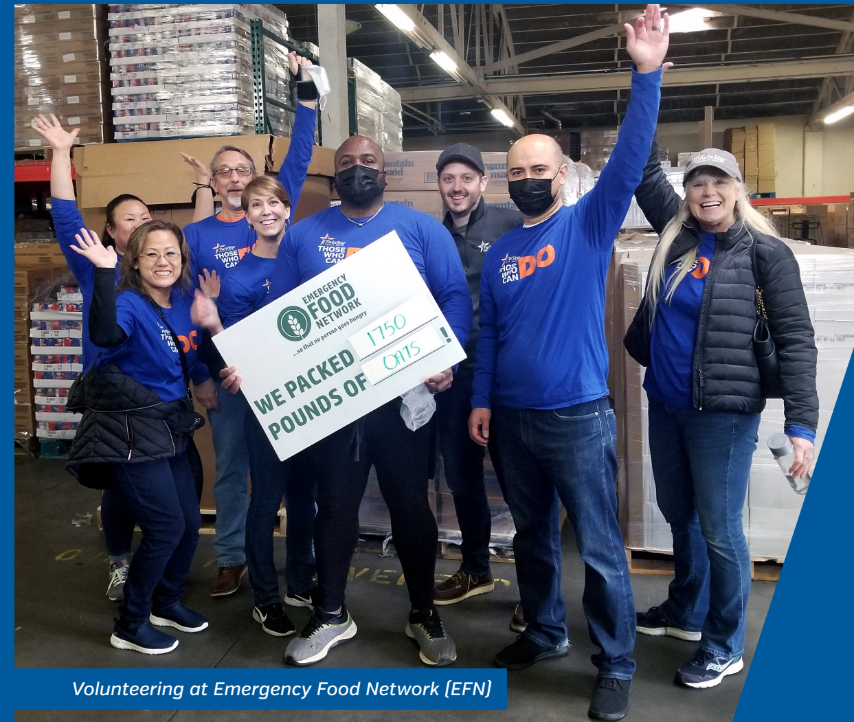
Volunteering at Emergency Food Network (EFN)