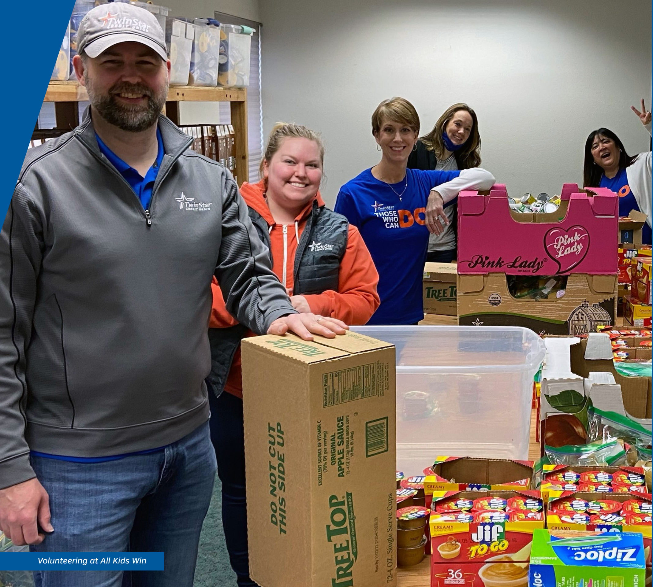
Volunteering at All Kids Win