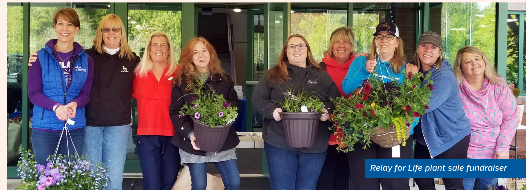
Relay for Life plant sale fundraiser

Relay for Life is the largest fundraising opportunity to support the American Cancer Society (ACS) fund groundbreaking cancer research, provide free information and support, and help with early detection and cancer prevention. In 2022, TwinStar was the 7th highest fundraising team at the Relay for Life of Thurston County, which finished in the top ten of all the Relays across the nation.